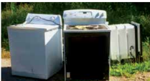
Outside placement of indoor/ appliances/furniture