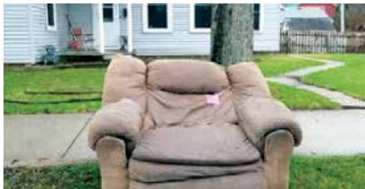
Outside placement of indoor/ appliances/furniture