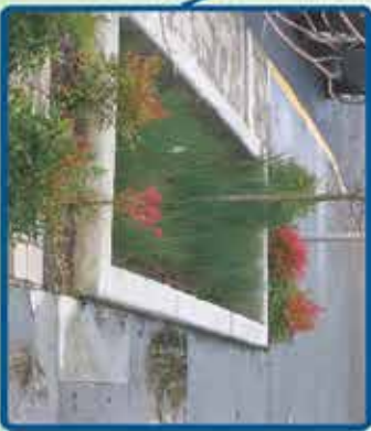
Tree Planter Box